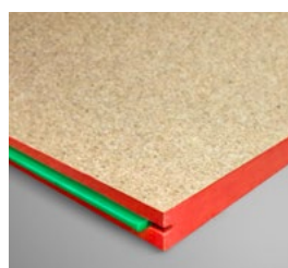
Termite Treated Green Tongue - 19mm