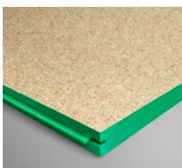
General Purpose Green Tongue - 19mm

EnduraFloor by Laminex Particleboard Flooring is also available in a Termite Treated option (identified with red wax sealed edges).