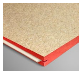
Termite Treated Beige Tongue - 22mm