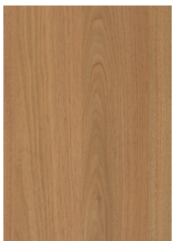
Cabinetry Tassie Oak

The combination of Tassie Oak cabinetry and Antique White interiors creates a timeless feel, while silver pull handles add contemporary style. Add additional layers of functionality, including shoe racks edged in Tassie Oak, that mirror the cabinetry doors.