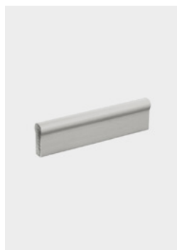
Linear Standard Handles Cord flat pull, Satin