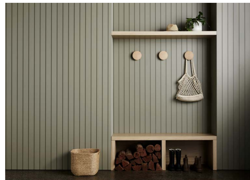
Left Batten 75 painted Dulux Serpent creates a stylish backdrop to this mudroom with joinery in Laminex Classic Oak.