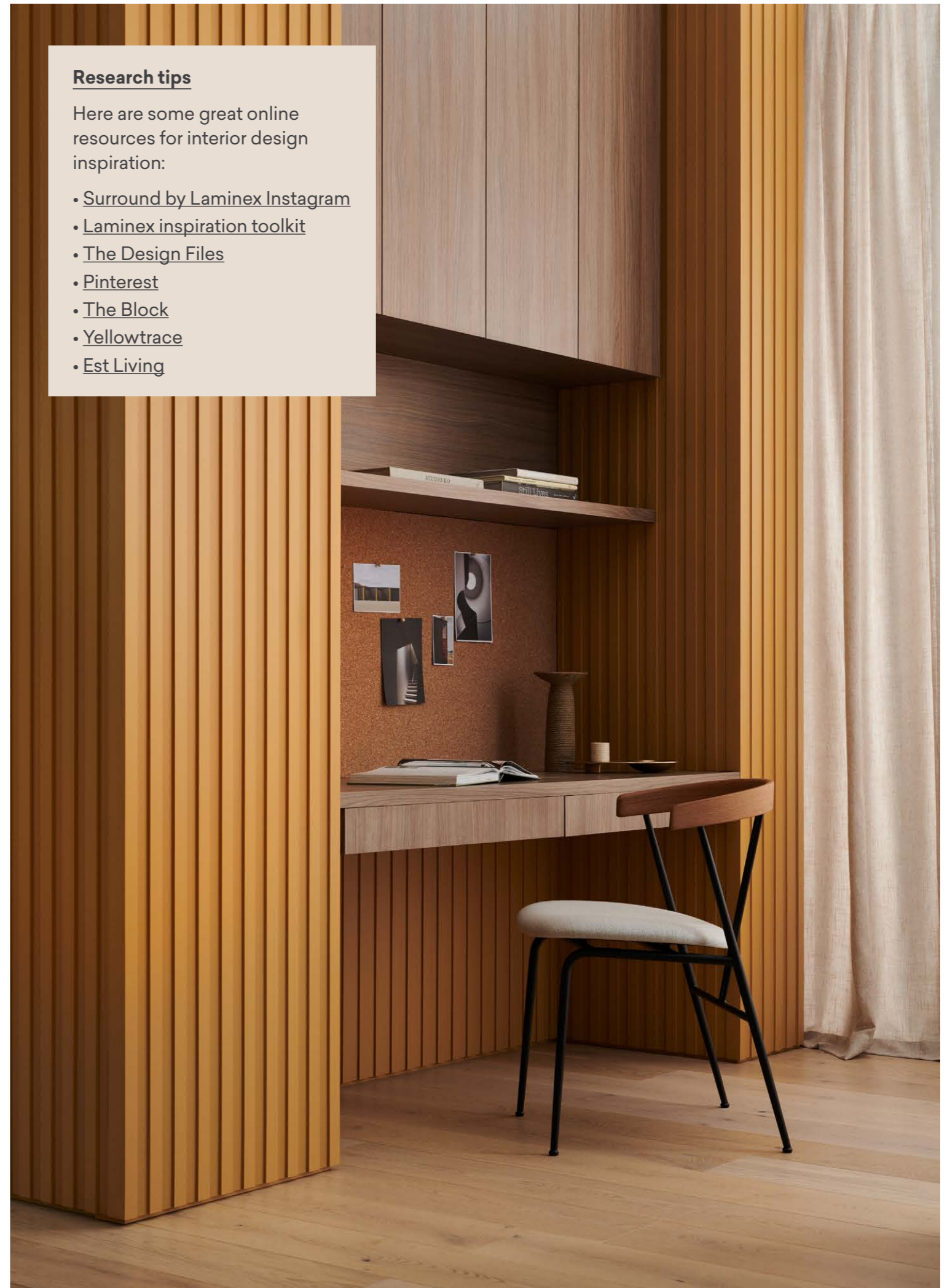
Opposite Study nook and hallway, designed by Studio Esteta, features Surround by Laminex French Stripe painted in Dulux Alluvial Inca.