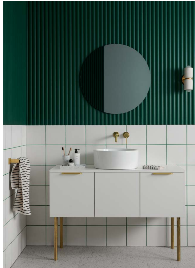
Above Contemporary split colour bathroom with Dulux Highland Green on the Demi Round 40 with a fresh white scheme below. Custom vanity is Laminex Calm White.

Deciding exactly how you use Surround by Laminex panels depends on a few factors; the architecture of the space, the type of profile you choose, the function of the room and the effect you want to achieve.