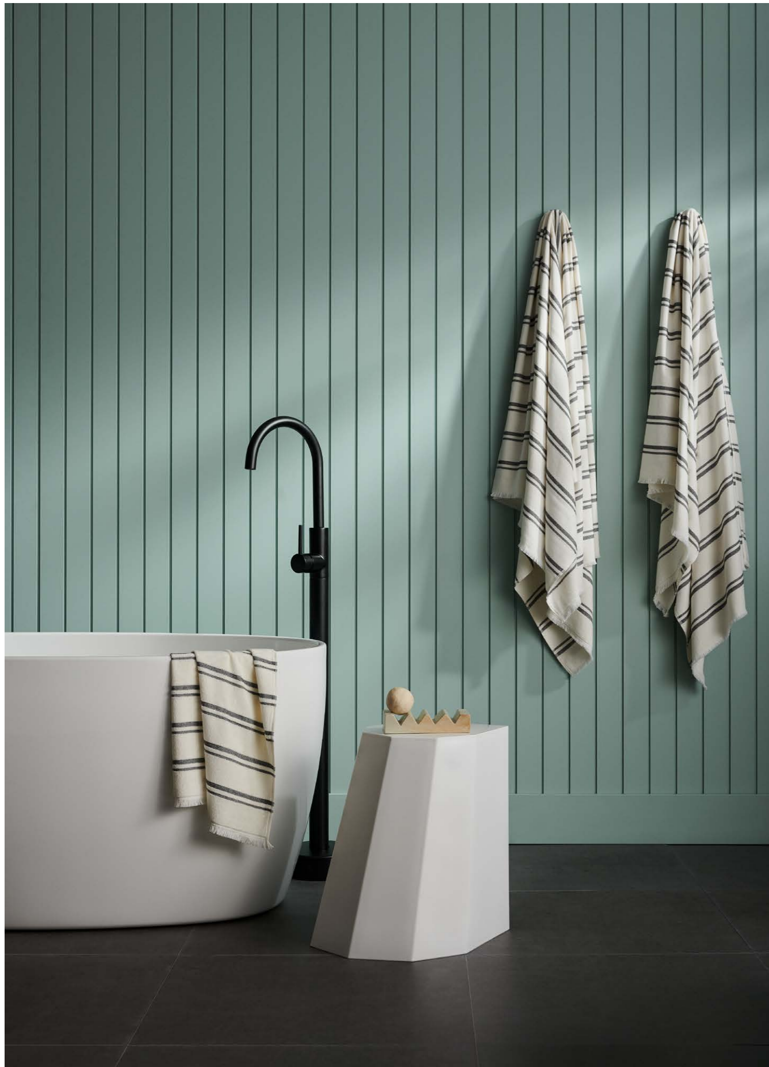
Left Surround by Laminex Batten 75 is painted in Dulux Silverdrop against striking slate floor and contemporary black tapware creating a bathroom sanctuary.