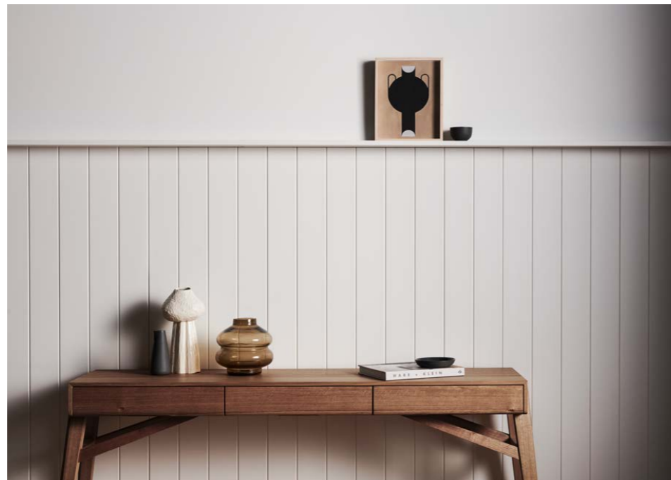
Right Classic VJ 100 along a modern hallway in Dulux Snowy Mountain will never date.