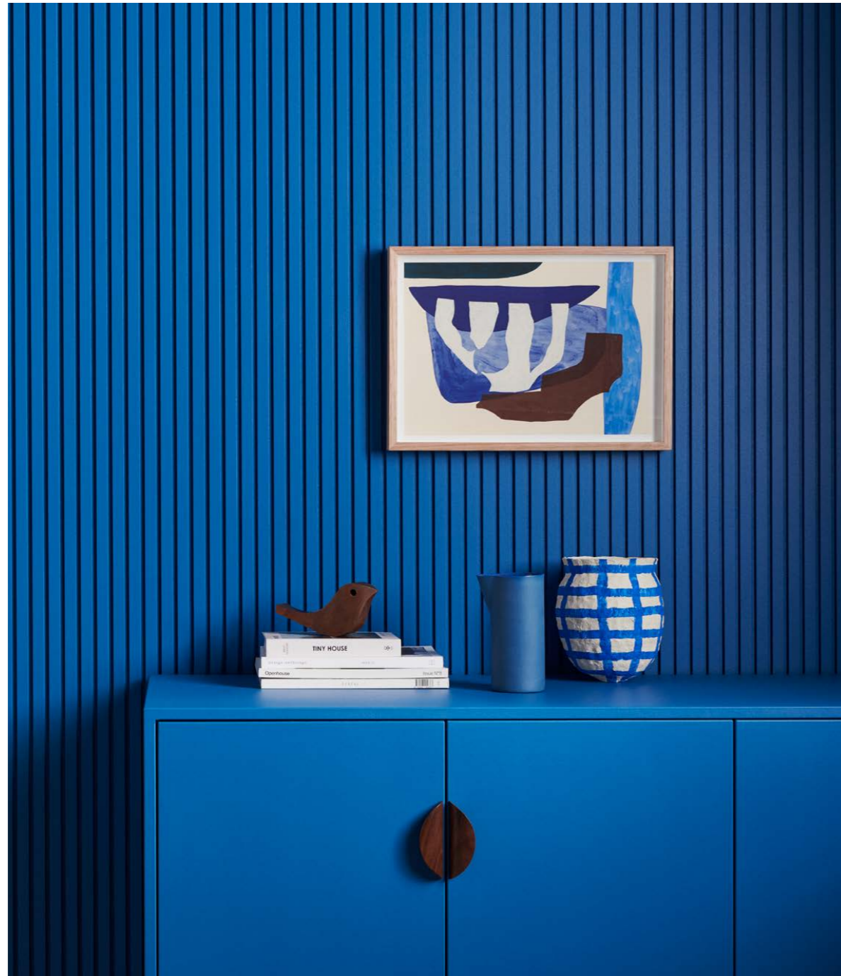
Below The beautifully graphic Batten 25 is striking painted in Dulux Royal Consort.

A great starting point is to identify the feeling you want to create in your room; calm, atmospheric, fresh or vibrant and playful? Another way of narrowing down is to consider furniture or artwork that can inspire the colour selection. Is there a key colour that will tie the whole room together?