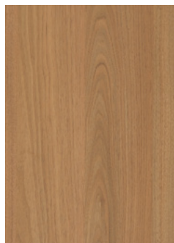
Cabinetry Tassie Oak