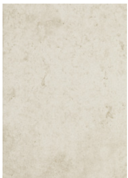
Benchtop White Cement

Form a base for these cement and oak look finishes teaming them with exposed brick. Enhance the closed-off kitchen wall with open shelving crafted in matching Tassie Oak for displaying kitchenware or decor. Finish the space with Bliss Shitake cabinetry interiors and wooden or cork flooring that taps into the oak look whilst creating effortless flow throughout.