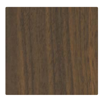
Milano Walnut ΝF