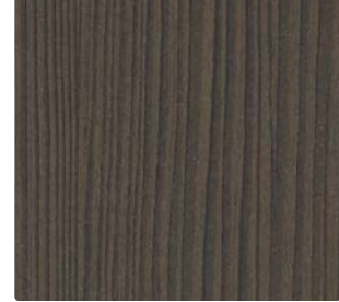
Espresso Ligna N NU