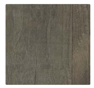
Seasoned Planked Elm ΝC