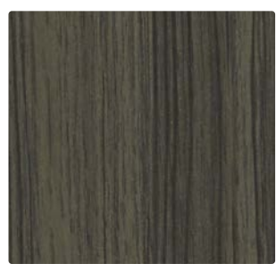
Domain N NU