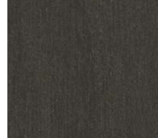
Black Birchply ΝC