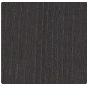
Burnished Wood n nu s