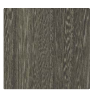
Blackened Elm ΝC