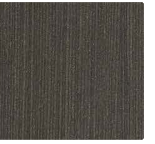
Licorice Linea ΝS