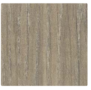
Delana Oak ΝC