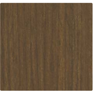
Cherry Riftwood Ń NU