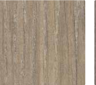
Delana Oak N C