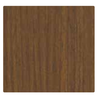
Cherry Riftwood N NU