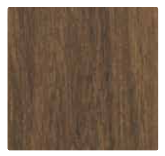
Aged Walnut N C