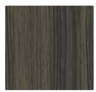
Domain N NU