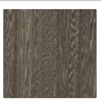
Blackened Elm N C