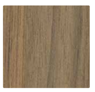
Danish Walnut N F