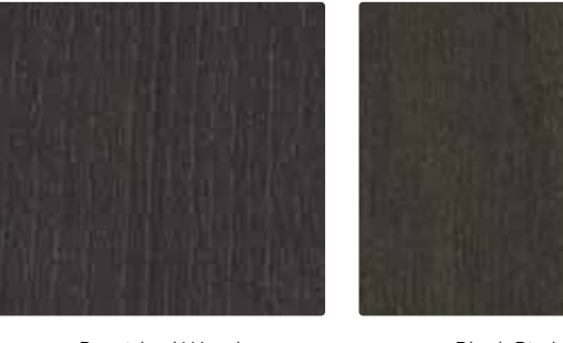
Burnished Wood N NU S