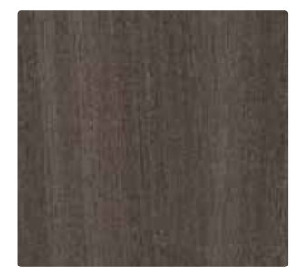
Smoky Sapelle N NU