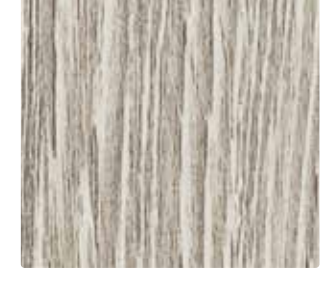
Bleached Wenge N C