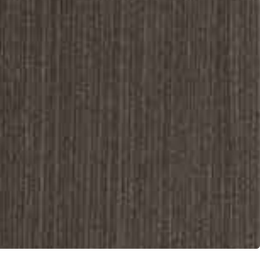
Licorice Linea N S