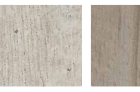
Concrete Formwood N C