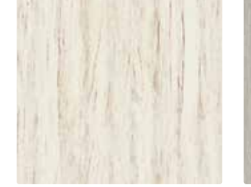
Alaskan N NU