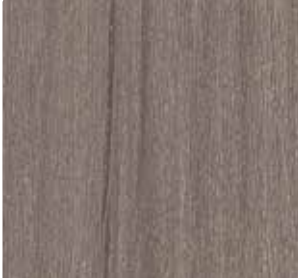
Greyed Woodland N C