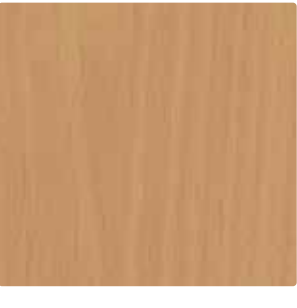
Select Beech ΝF