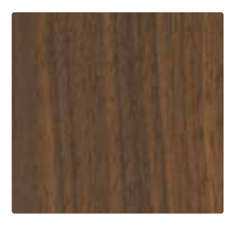
Milano Walnut N F